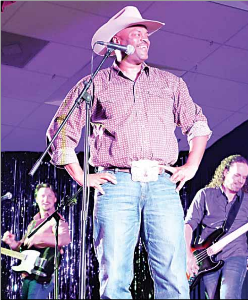
Cowboy Troy's music was unique, and his energy was infectious. He had the audience up out of their seats and moving to some of their, and his, favorite hits.