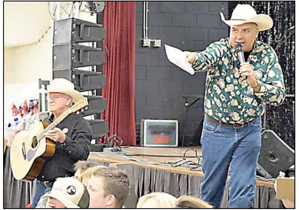
Several grand items were auctioned off, including guitars, dinners, concert tickets, a rifle and more. A bidding war even erupted that brought in $11,000 for a single item.